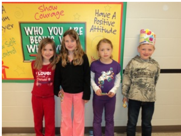
First Grade April Birthdays